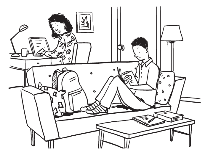
Editor's note: Guidelines are changing rapidly. Make sure to follow all local, state, and federal laws and recommendations on social distancing and other practices when using these ideas.

Keep your children learning and safely occupied while they're not in school and can't hang out with friends. This guide features tween- and teen-friendly activities and challenges, including a bingo card on the back.